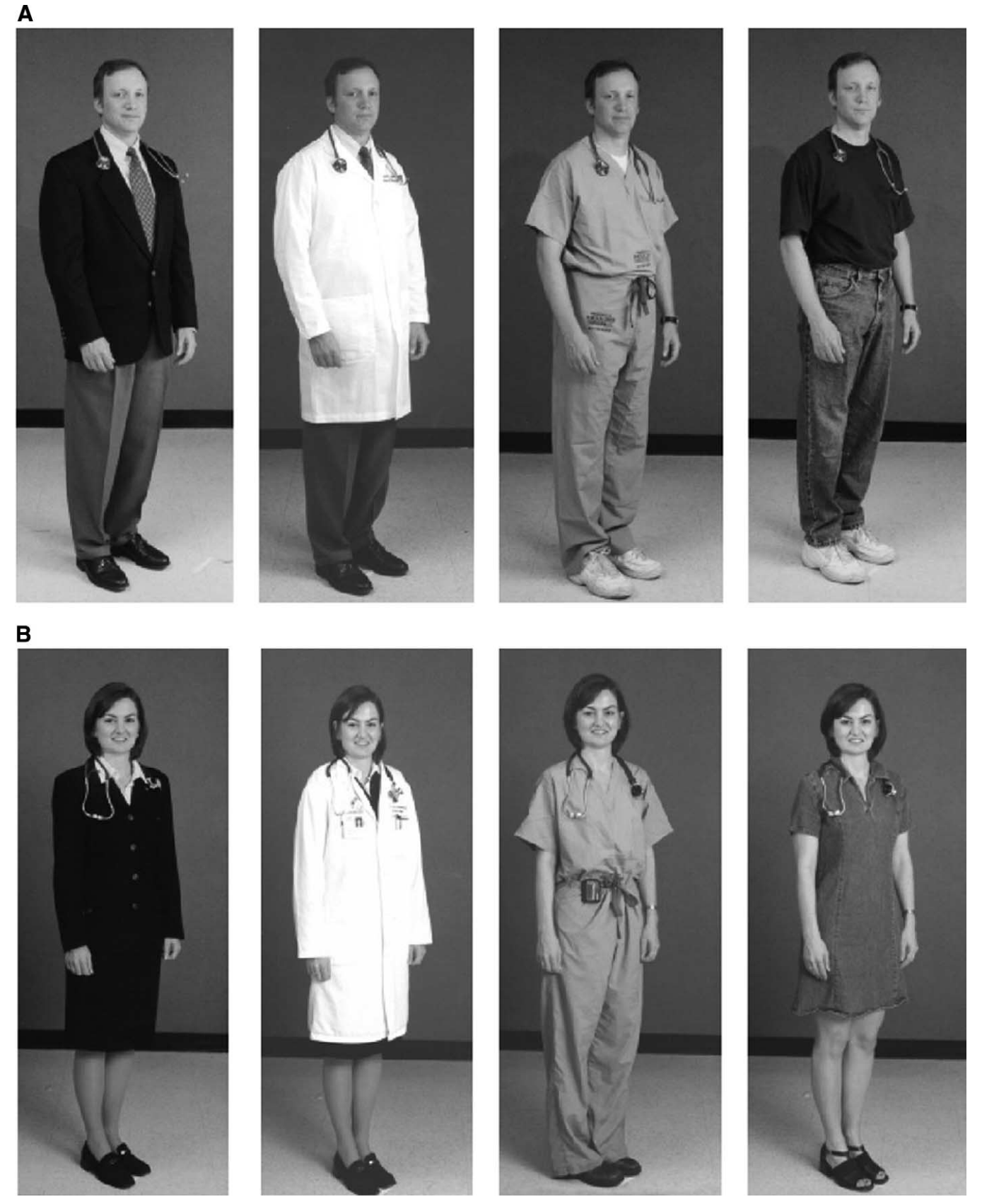
Figure 1 (a) White male doctor dressed in 4 different styles. (b) White female doctor dressed in 4 different styles. (c) African-American male doctor dressed in 4 different styles. (d) African-American female doctor dressed in 4 different styles.